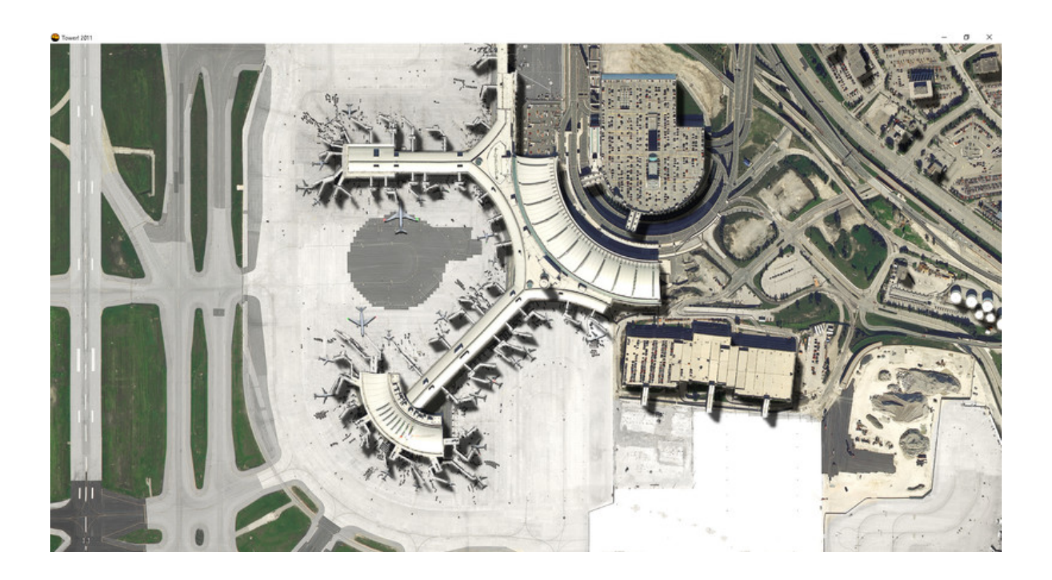
Tower!2011:SE - Toronto [CYYZ] Airport Torrent Download [serial Number]

Download >>> <a href="http://bit.ly/2SHjURm">http://bit.ly/2SHjURm</a>